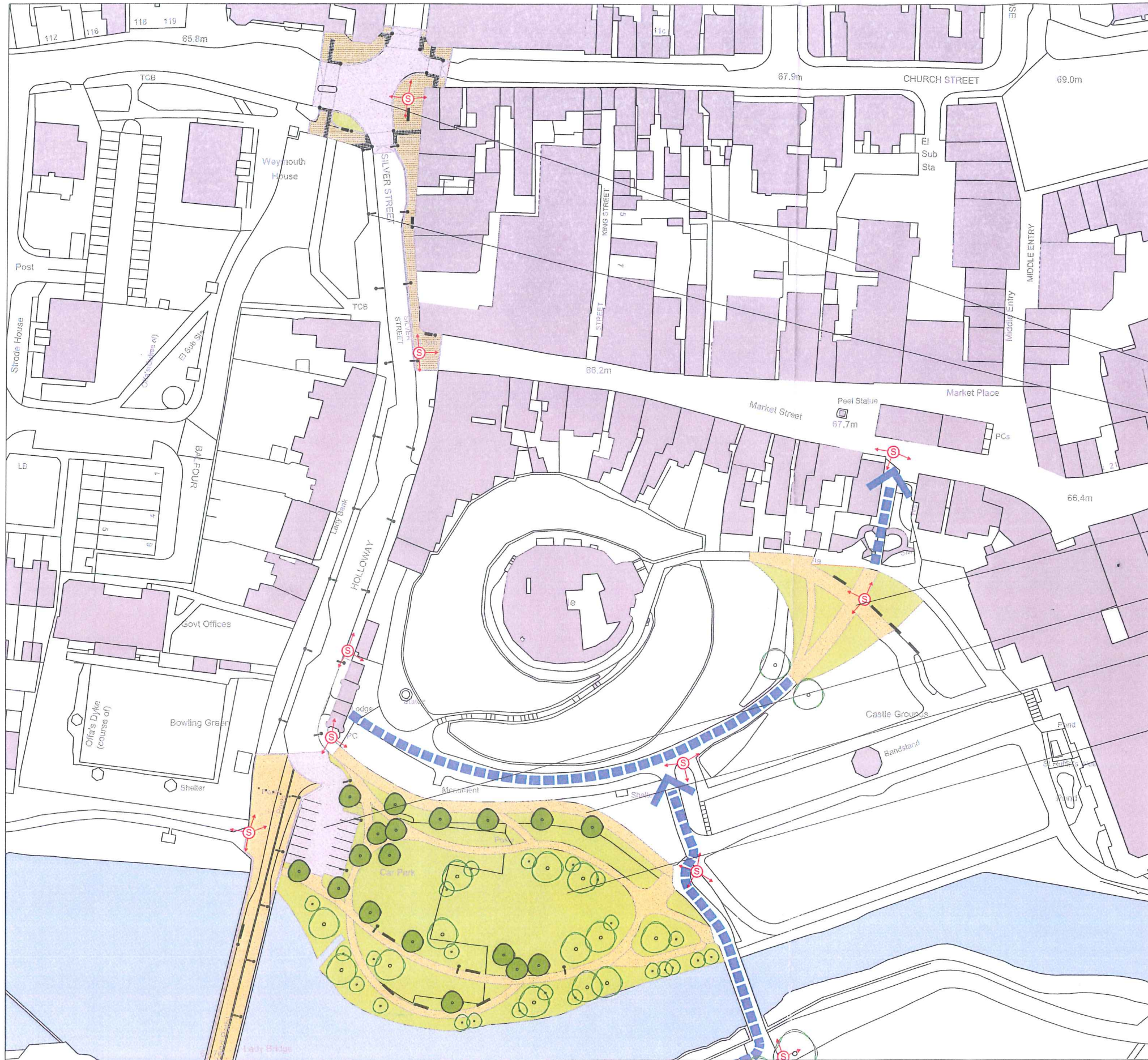
KEY PLAN (NTS)